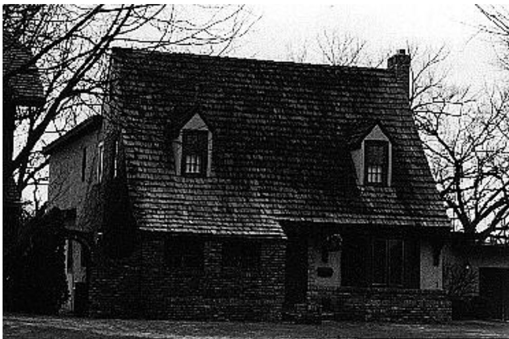
Image 8. 705 Riverside Dr. SE, Putnam House, SH-SCC-303

SH-SCC-302 702 Riverside Dr. SE Towne House SH-SCC-303 705 Riverside Dr. SE Putnam House SH-SCC-304 707 Riverside Dr. SE Putnam House SH-SCC-305 708 Riverside Dr. SE House SH-SCC-306 1226 Kilian Blvd. Forrester House SH-SCC-307 630 Riverside Dr. SE Doane House