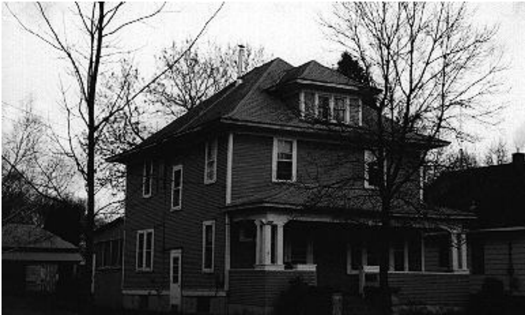
Image 7. Welin House, 430 5 th Ave. SE, BN-SCC-197