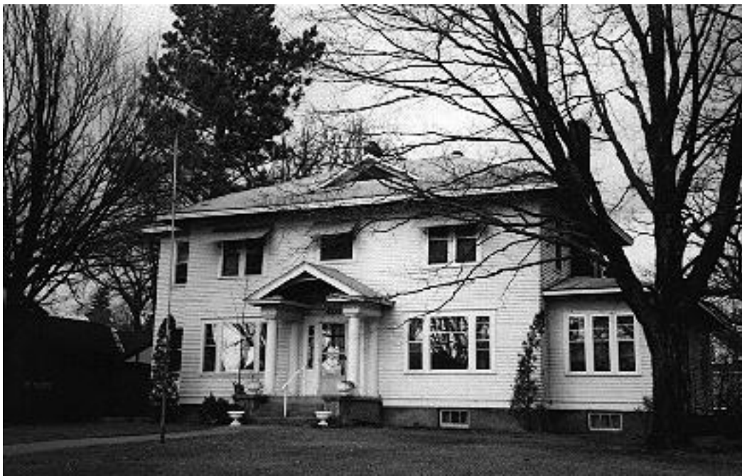
Image 5. Bostrom House, 402 Riverside Dr. SE, BN-SCC-129

Three properties have contributing walls located on the property. The Hagberg House, 650 5 th Ave. SE, has a ca. 1900 granite retaining wall located at the front of the property. The Thoele House, 726 Wilson Ave. SE (SH-SCC-071) has a ca. 1926 fieldstone retaining wall at the front of the property. The Steininger House, 432 4 th St. SE (BN-SCC-140) also has a fieldstone retaining wall at the front of the property. Additional secondary features included in the inventory are granite posts located at 924 8 th Ave. SE (SH-SCC-147), 1013 8 th Ave. SE (SH-SCC-150), and 1021 8 th Ave. SE (SH-SCC-151), and a hand pump located behind 923 9 th Ave. SE (SH-SCC-168).