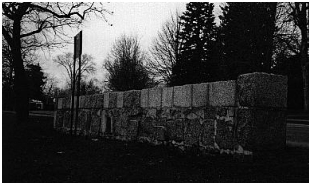
Figure 2. WPA Granite Wall, 9 th St. & Riverside Dr. SE, SH-SCC-297

All properties constructed prior to 1955 were included in this survey. The only properties not included were those already inventoried and on file at the SHPO.