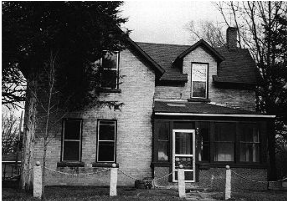
Figure 4. Bensen House, 924 8 th Ave. SE, SH-SCC-147

Also included in this context are the eight granite WPA walls located along Riverside Dr. in the survey area. Members of the Works Progress Administration constructed approximately 29 gray granite walls throughout St. Cloud during the late 1930s and early 1940s. All walls in this survey area are located at intersections along Riverside Dr. SE, to block motor traffic from the steep riverbank.