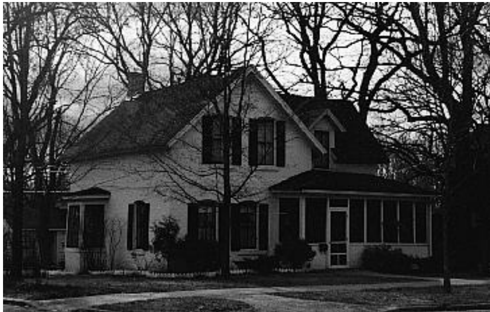
Figure 1. Cambell House, 427 Wilson Ave. SE, BN-SCC-162