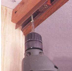
Sliding patio door upper track