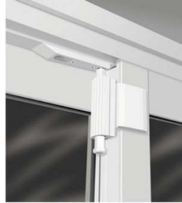
Patio door auxiliary lock