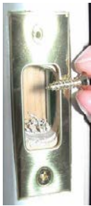
Regular strike plate